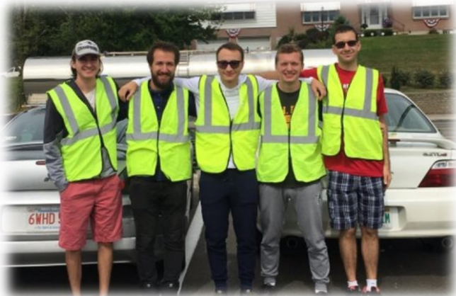
Chi Phi Brothers cleaning up Hoosick Street for Adopt-A-Highway