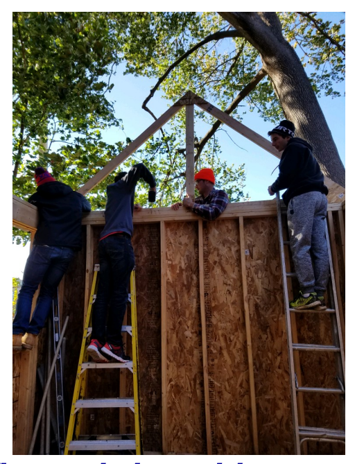
The new shed, a work in progress