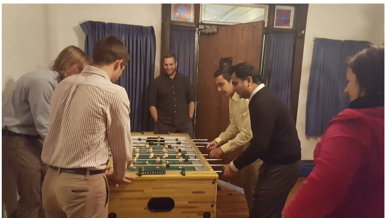
Brothers taking on their professor in foosball after the faculty dinner